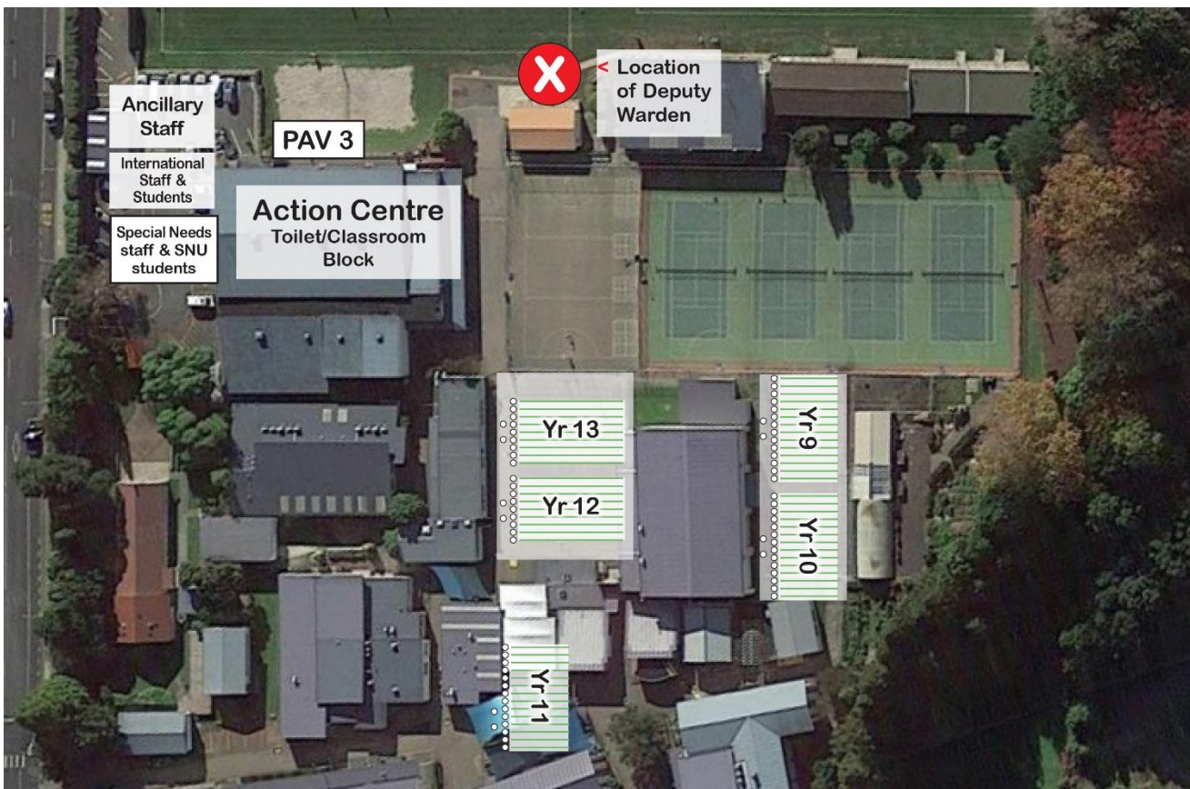
Wet Weather Plan

Students remain lined up and sit in form class lines in these covered areas until the 'All Clear' (2 short rings of the school bell) is given by the Chief Warden.