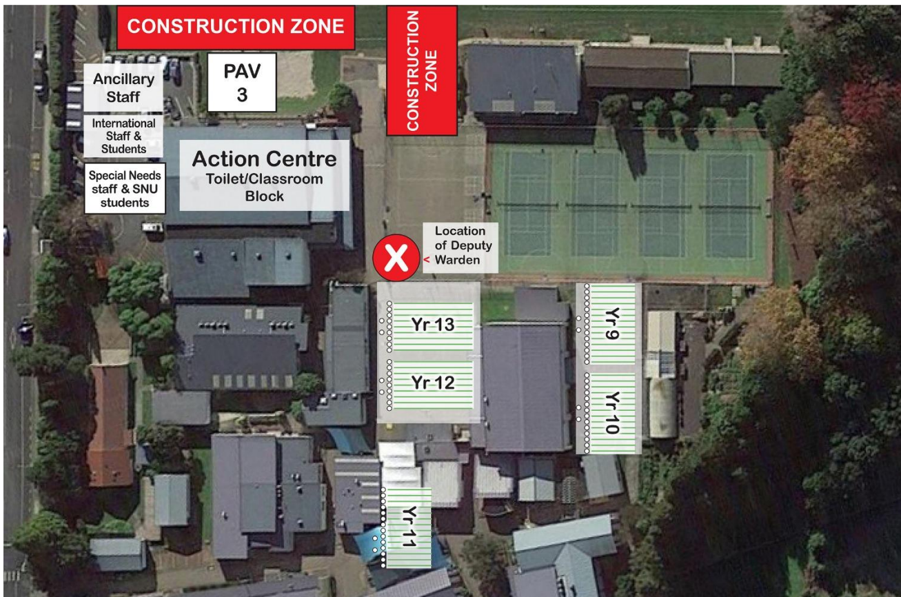
Wet Weather Plan

Students remain lined up and sit in form class lines in these covered areas until the 'All Clear' (2 short rings of the school bell) is given by the Chief Warden.